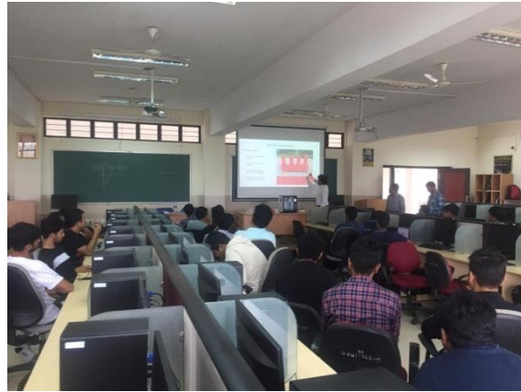
“Concepts in Mechanical Engineering for Competitive Exams” & Fusion 360 and 3D Printing